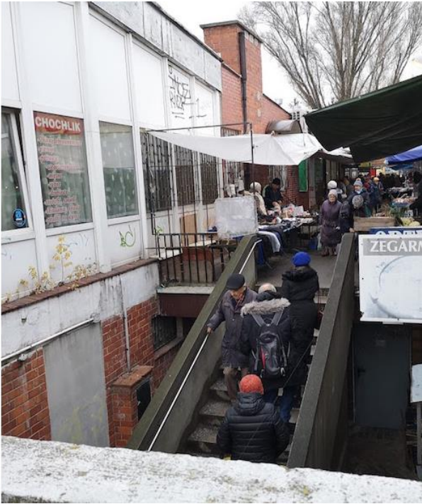
The vegetable market on the Juliusza Słowackiego estate, Lublin