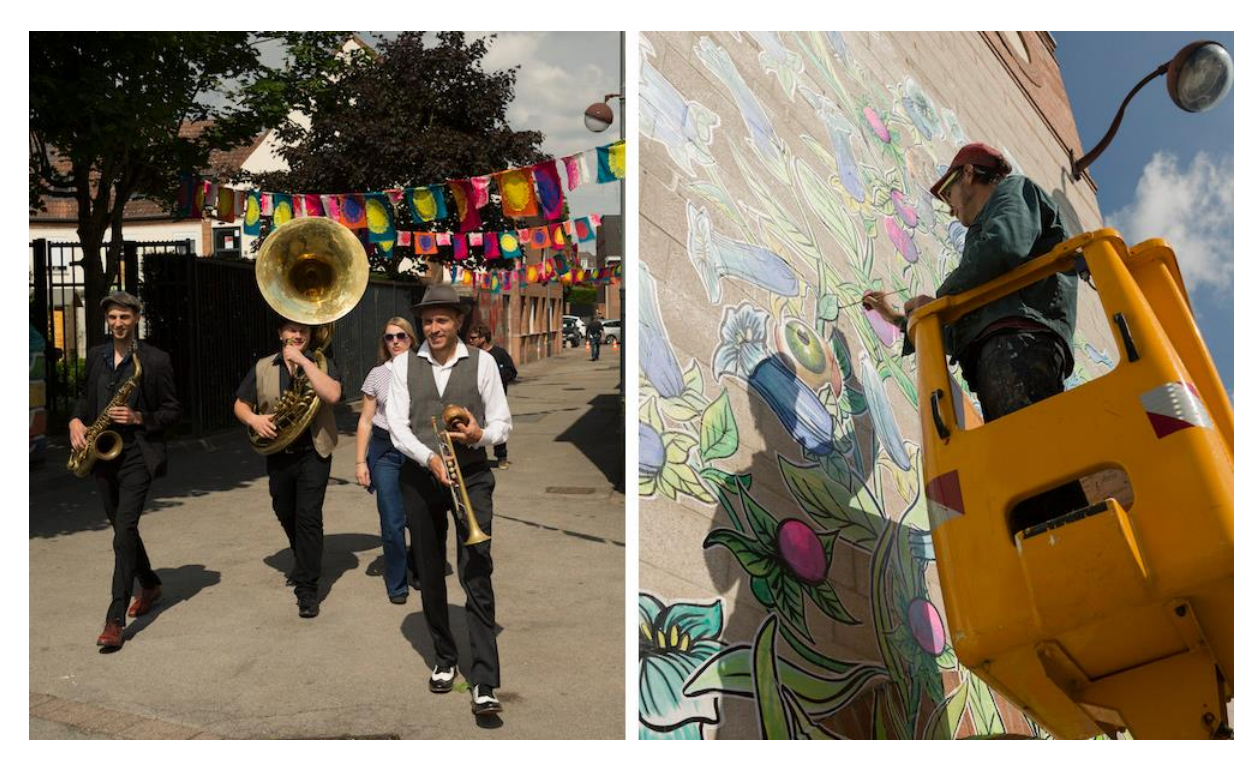
Théâtre La Licorne bring music and install a mural at the Docteur Paul Breynaert residence, Béthune