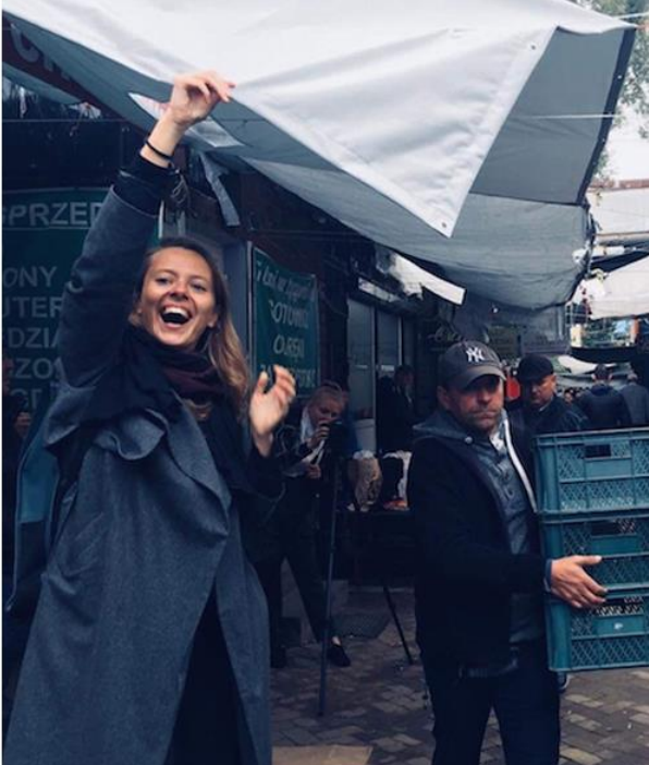
The Juliusza Słowackiego estate, Lublin