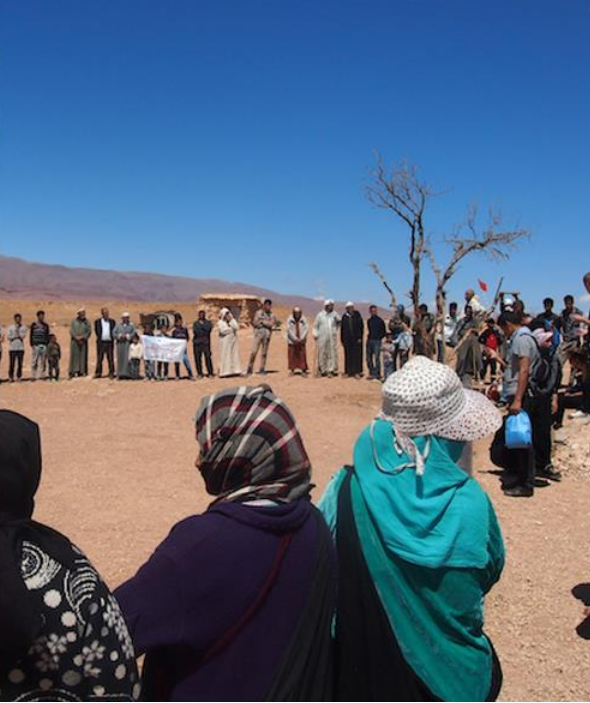
Meet the Neighbours public symposia in Marrakech, Morocco