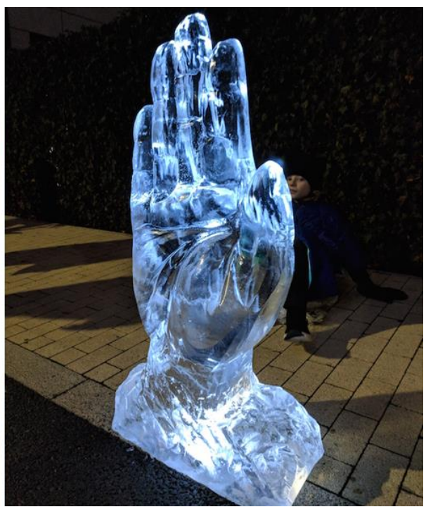
The Tenancy house, Manchester