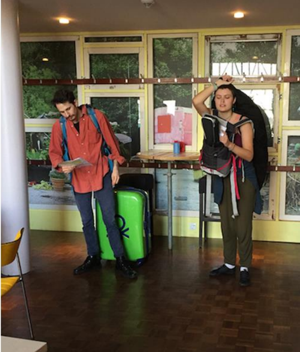
The Grand Theatre, Groningen