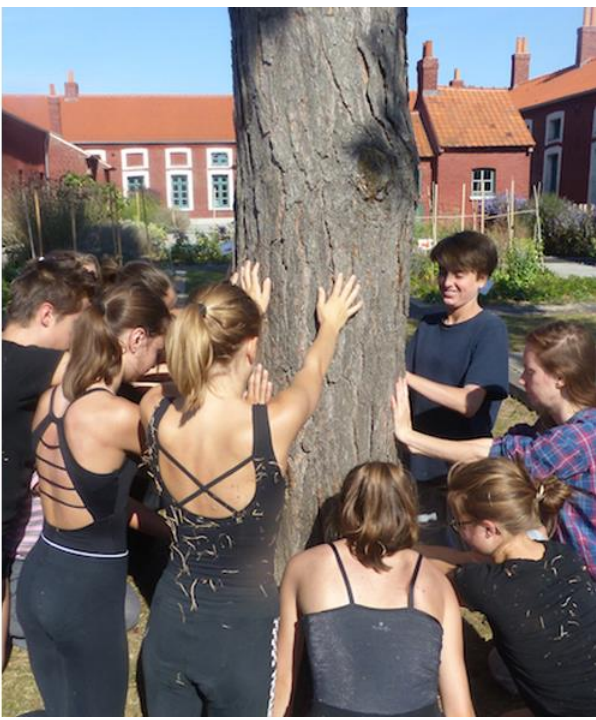
The Cité des Électriciens, Béthune